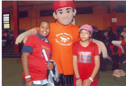
Dewey Does visits the Body Sculpt Children's Health Expo in Harlem, N.Y.